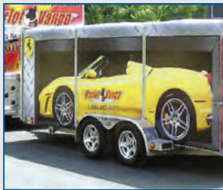
Vango on a Car Hauler