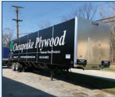
Our graphic department turns your Vango into a moving billboard!