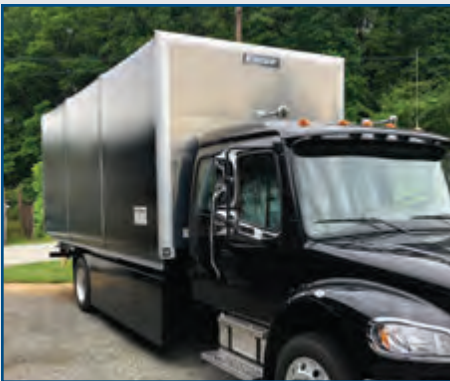
Straight Truck Vango