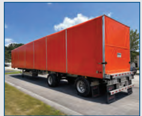
Make your Vango stand out with color!