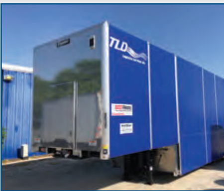
Dropdeck Vango - no midpoint connection