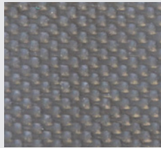
HD Vinyl (18 oz)